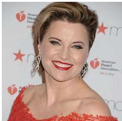
Actress Lucy Lawless

"I thought it would be nice if this guy knew someone had defended him, but I did not expect such a thing." It is surprised and amused Lucy Lawless, New Zealand actress, Xena Princess of the famous TV series 90 years, author of the anti-racist post on Facebook that went viral within hours.