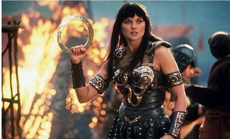
Lawless in the role of Princess Xena TV series

fear. It is ironic to think that Italians were themselves migrants, I would have sworn that racism, here, was something less strong. Not so, apparently. "